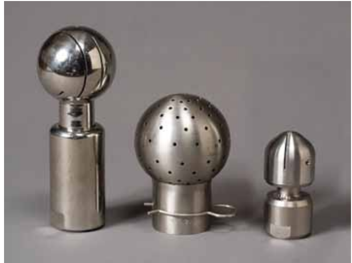
From Left: BRASRH360NPTG07, BRASTC360R100, and SSP2.