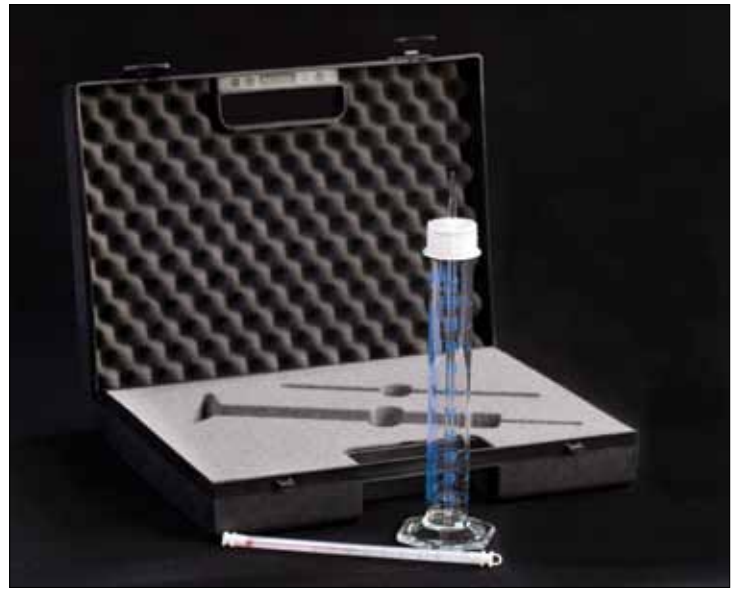
Shown with Storage Case

This special device measures milligrams per liter of dissolved CO 2 . By agitating the sample the increased pressure displaces some of the wine and the data is converted by temperature and volume to determine the milligrams per liter of dissolved CO 2 .