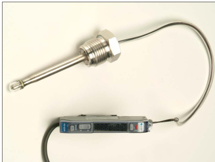
NANOCHEM® DC End-Point Detector Probe and Digital Sensor