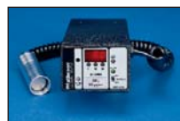
Model IQ250, IQ350

Exclusive MEGA-Gas™ sensor and GAS SEARCH feature determines the presence or absence of more than 100 gases and vapors. Provides rapid confirmation it is safe, or unsafe, to enter an area. Data management & software too. BR-40