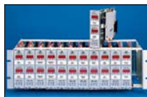
Model MAT Series

Detect-A-Leak™ is available in both regular and low temperature formulas, and exceeds MIL-L-25567D Type I and II specifications. TB-288