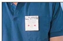
Model 8005, 8006, 8007

Personal monitor and leak detector accommodates detection of a variety of gases and vapors without the need for multiple detectors. TB-218