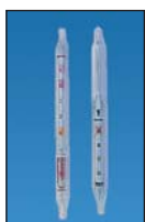
Model 8070, 8075

Cost effective solution to air analysis. Measures concentrations of hazardous gases and vapors, on-the-spot. Single stroke, constant volume pump reduces errors inherent in other pump designs. Sample Vue™ indicator shows when sampling is completed. Over 250 tubes available. BR-56, TB-102-1