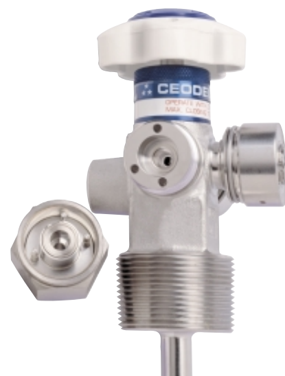
Valve Cylinder Connections

The standard 1000 gram VAC BF 3 package contains 357 liters of gas. At a process flow of 2 sccm's, lifetime is expected to be approximately 2975 running hours.