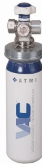
2.2 L VAC Cylinder

(1) United Electric - Staset® model EA15. This device incorporates pressure sensing (4 - 770 torr) and a single point contact switch.