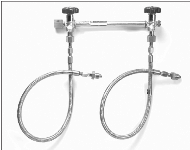
The SourceTrak™ Manifold System distributes gas safer and more efficiently.