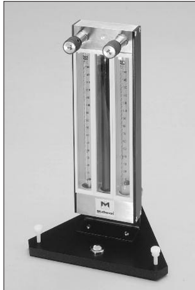
Model 7300 Series