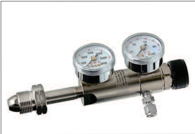
Model 2213-590T shown. Part number SEQ2213590T