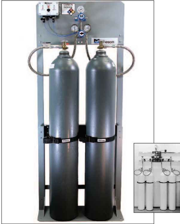
The SwitchPro™ Automatic Switchover System provides continuous gas delivery. (Shown with rack mounted option)