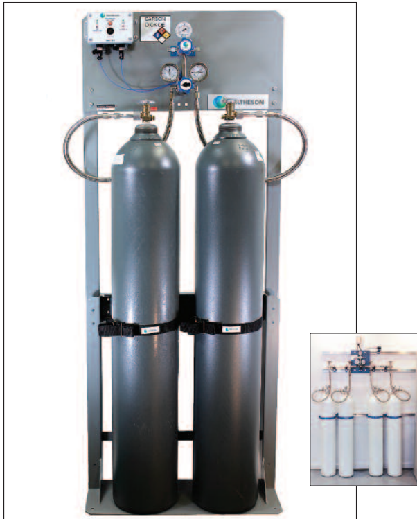
The SwitchPro™ Automatic Switchover System provides continuous gas delivery. (Shown with rack mounted option)