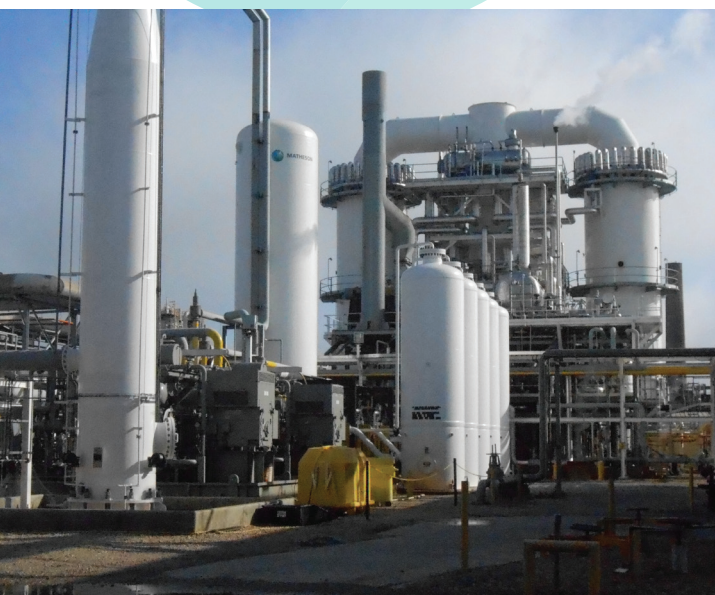
MATHESON Steam Methane Reformer, Pensacola, FL