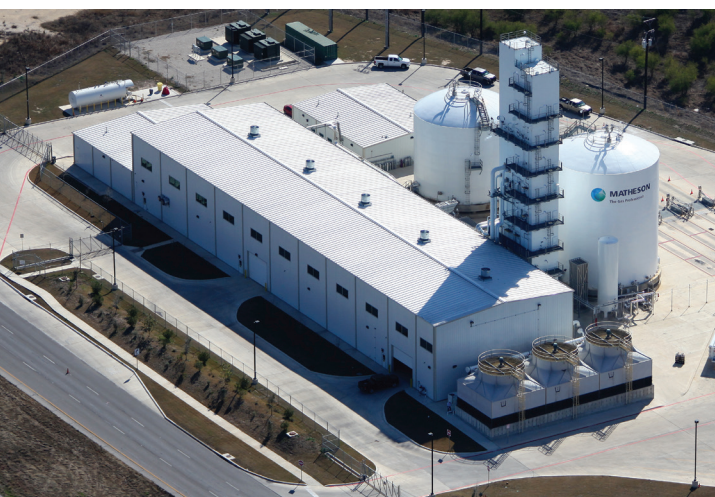
MATHESON Air Separation Unit, San Antonio, TX

MATHESON delivers gas, gas handling, application and engineering expertise, plus plant or sub-system construction, maintenance, expansion, and upgrades.