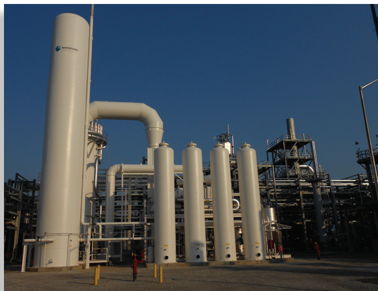
MATHESON Steam Methane Reformer, Columbus, MS

MATHESON can arrange to provide Nitrogen and turnaround services to help your chemical plant get back up and running as quickly as possible. Using state-of-the-art equipment and MATHESON gases, we can provide cooling, heating and purging services on a short-term or intermittent basis.