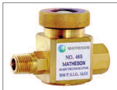
Model 465 Moisture & Impurity Indicator