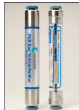
PUR-Gas™ Purifier Systems