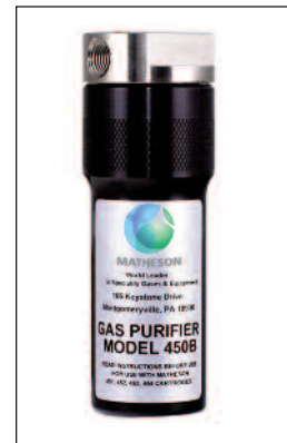
Model 450B High Pressure / Low Capacity Gas Purifier