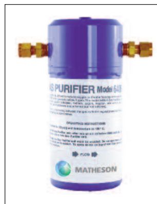
Model 6406 Oxygen Removing Inert Gas Purifier

To improve and support laboratory performance, Matheson now offers PUR-Gas™, an innovative series of cartridge-type and in-line purifiers for point-of-use applications. These systems allow easy replacement of the exhausted cartridges within seconds without the use of any hand tools, thus minimizing operating downtime. The PUR-Gas™ purifiers are available to remove moisture, oxygen and hydrocarbons. In addition, a PUR-Gas™ System for Nitrogen is also available to enhance LC/MS instrument operation.