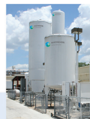
Onsite & Pipeline Plants