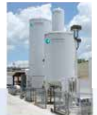
Onsite & Pipeline Plants