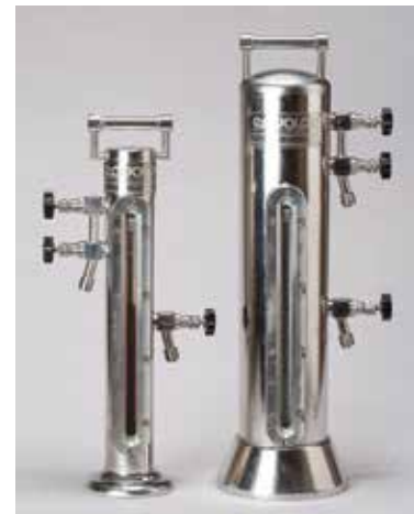
1,000 gm 5,000 gm