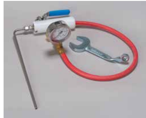
Shown with SO 2 Wrench and SO 2 Hose