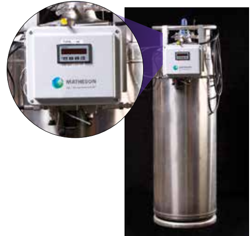
42 gallon system with stainless steel brackets

Scan for more information on MATHESON Wine products and services