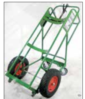
42 gallon liquid cylinder cart