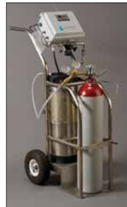
5 gallon system with stainless steel cart